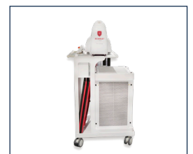
Scarlet Room Decontamination